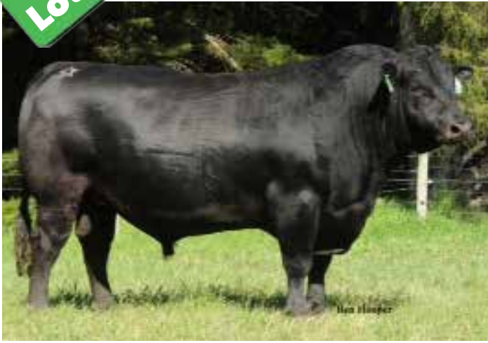
SIRE: Te Mania Emperor VTME343