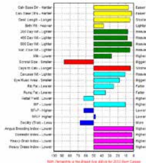
EBV Percentiles for Sire: TE MANIA EMPEROR E343(AI) x Dam: BOOROOMOOKA WINCH B69(AI)