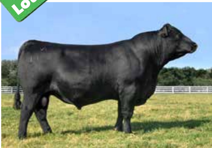
SIRE: V A R Reserve 1111(ET) USA16916944

SIRE: V A R RESERVE 1111(ET) x DAM: BOOROOMOOKA VOLITION C11(AI)(ET)