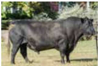
Booroomooka Barnaby E246

BOOROOMOOKA BARNABY E246 or BOOROOMOOKA GALILEO G501