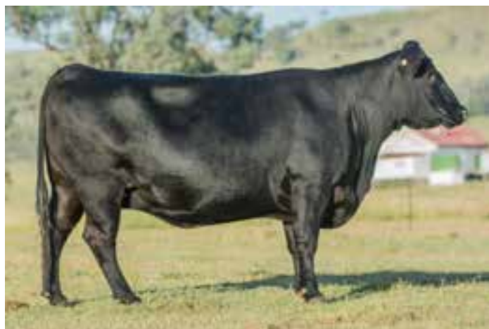
DAM: Booroomooka Volition C11(AI)(ET)NGMC11