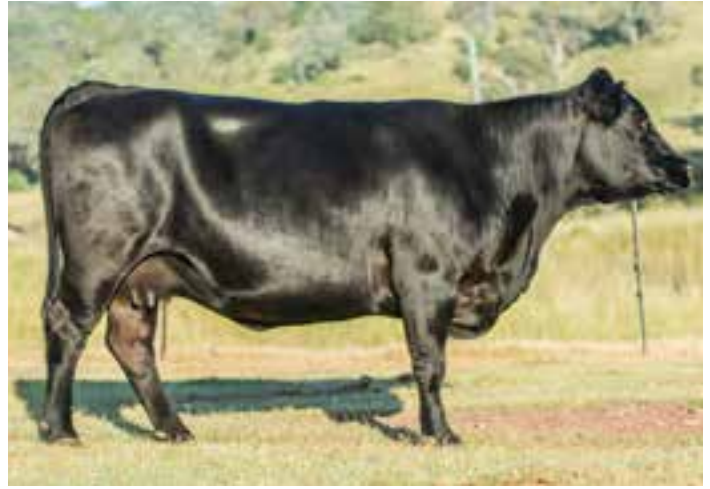
DAM: Booroomooka Winch B69(AI) NGMB69