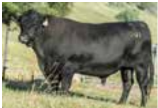
Booroomooka Galileo G501